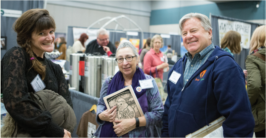
Exhibit Hall Hours

Thursday, February 15 4:00-7:00 p.m. Friday, February 16 8:00 a.m.-6:30 p.m. Saturday, February 17 8:00 a.m.-3:30 p.m.